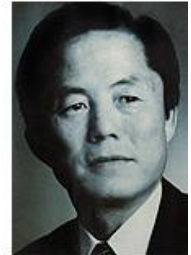
General Choi Hong Hi

Since 1955, TaeKwon-Do has gone through many transformations. Most notably, in 1988, the world saw the sport-style of TaeKwon-Do demonstrated in the Olympics. In fact, hundreds of TaeKwon-Do organizations have sprung up world-wide, offering many different directions for the martial art.